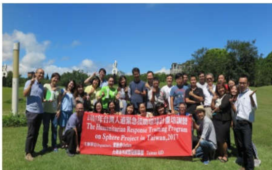
The Humanitarian Response Training Program on Sphere Project in Taiwan, 2017 ... READ MORE