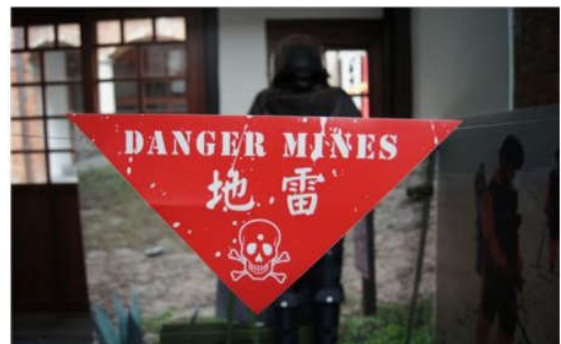
The Ottawa Treaty 20 years on: Calling for a Mine-Free Myanmar ... READ MORE