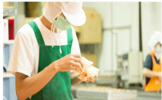
Eden wishes everyone a happy Mid-Autumn Festival ... READ MORE