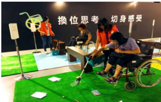
"2017 Touching Life" – a sustainable paradise you have never experienced! ... READ MORE